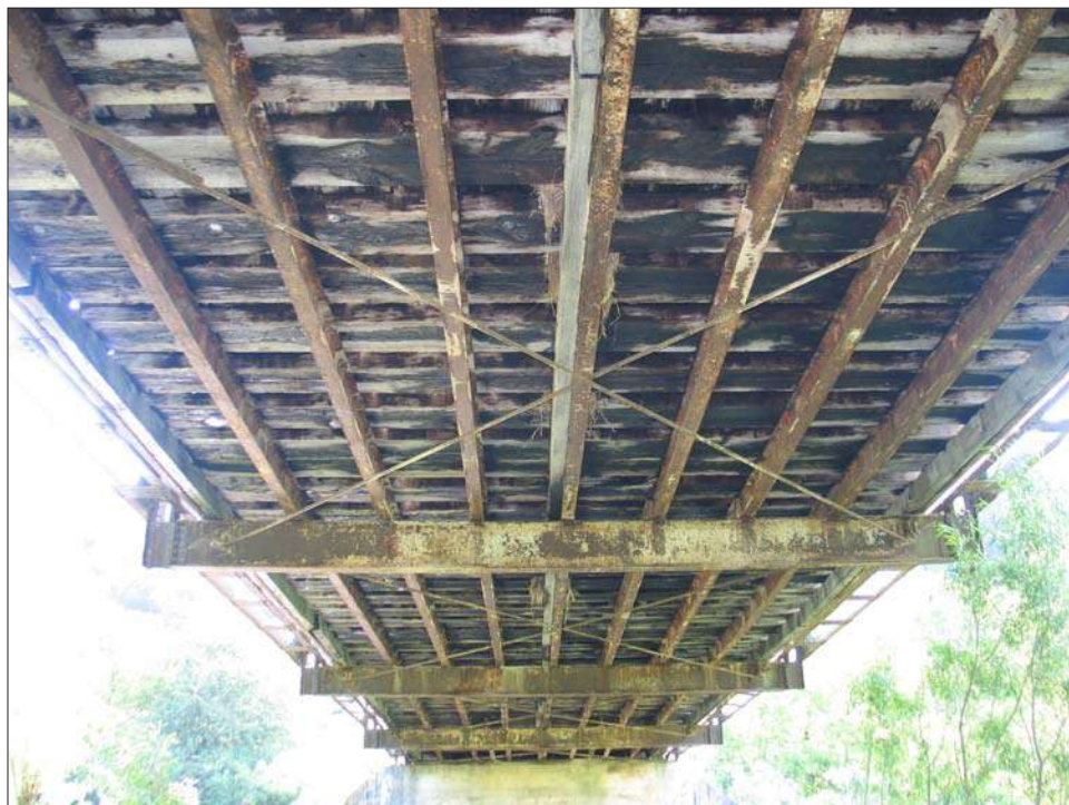
Coverage of the bridge substructure. View to the east (6/20/13).