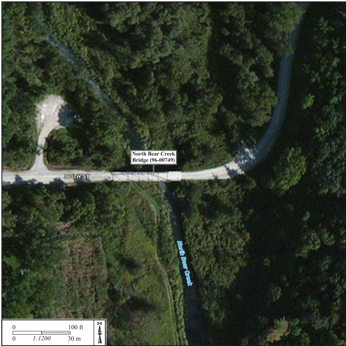
Scale map of the bridge.