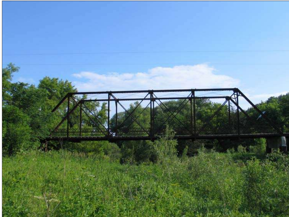
Profile of the bridge. View to the north (6/20/13).