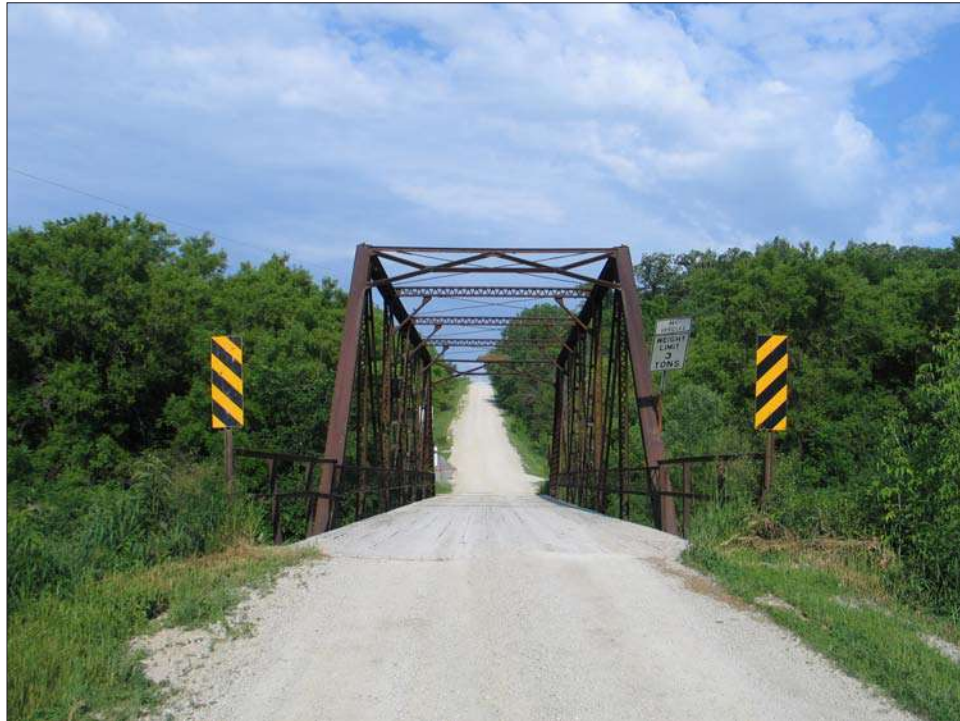
Western approach to the bridge. View to the east (6/20/13).