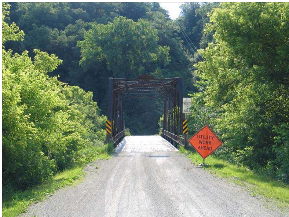
Eastern approach to the bridge. View to the west (6/20/13).