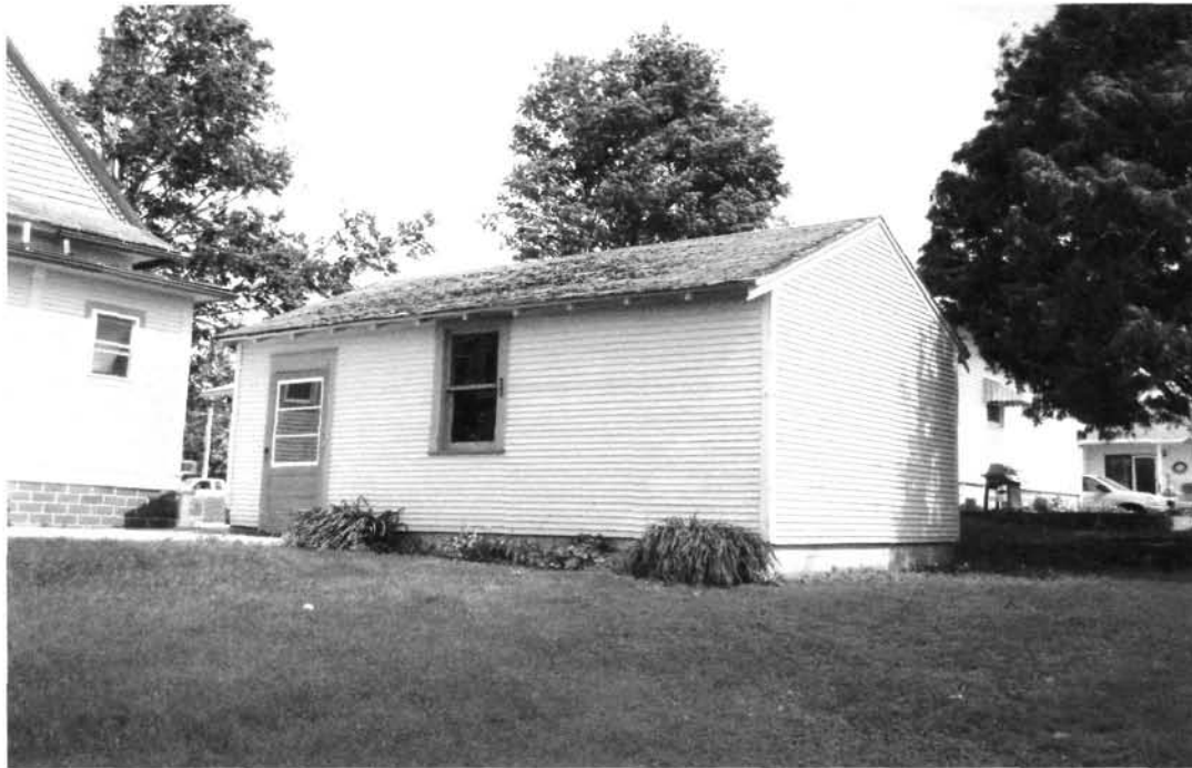
This view is of the garage.