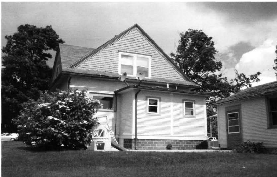
This view is of the back of the home and part of the garage.