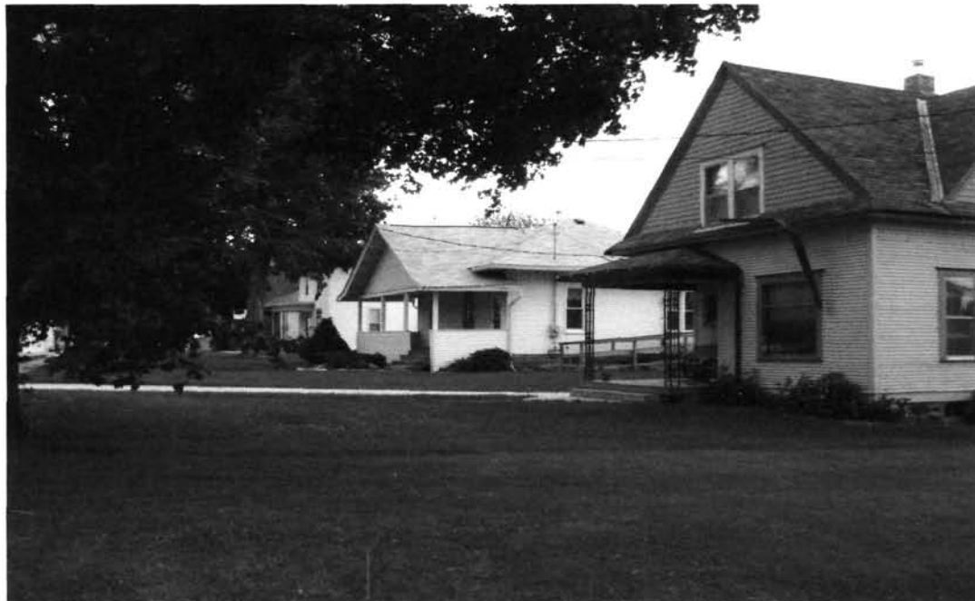
This is the street view of the home.