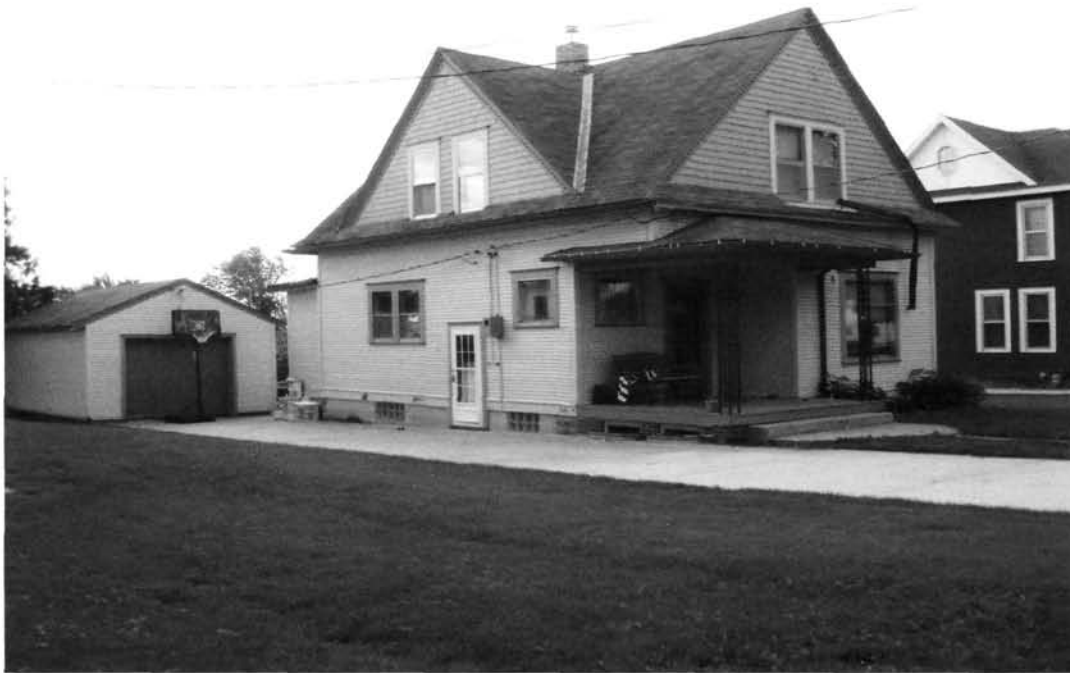
This view is from the northwest and also shows part of the home next door.