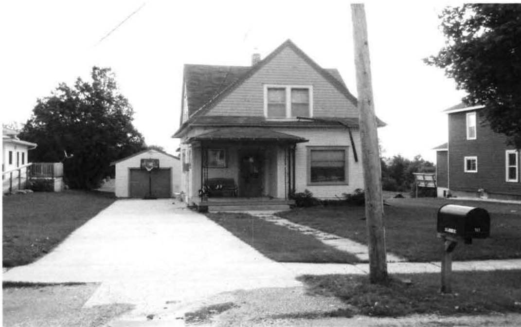
This view is from the west and features the front of the home and the front of the garage.