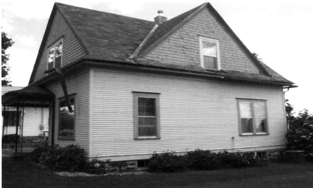
This view is of the south side of the home.